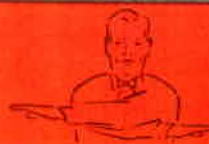
Penalty refused, incomplete pass, missed goal, etc.