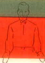
Crawling, pushing or helping runner