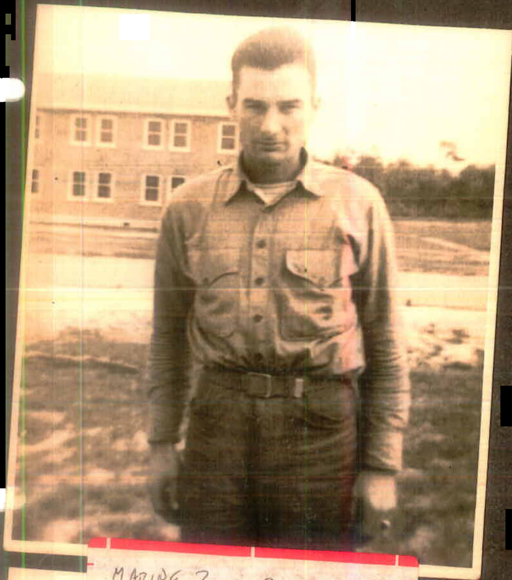
MARINE BOOT CAMP - 1964