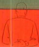
Illegal forward pass