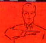
Player illegally in motion