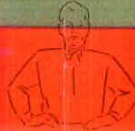
Off-side and violation of kick-off formation