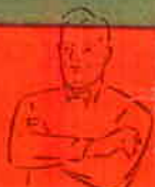
Delay of game or extra time-outs